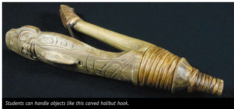
Students can handle objects like this carved halibut hook.