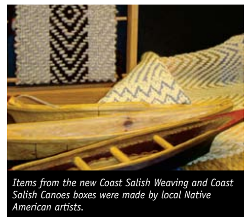
Items from the new Coast Salish Weaving and Coast Salish Canoes boxes were made by local Native American artists.

began two years ago with a Burke initiative to re-house and update every collection. One of the most rewarding sub-projects of this initiative began when meeting with our Native American Advisory Board about our preliminary plans to update the teaching collections. Our board members quickly identified two missing and needed boxes, Coast Salish Canoes and Coast Salish Weaving. Grants were found, native artists were identified and contracted to produce canoe models, weavings, and model looms, and lesson plans were developed and tested. To support teachers in communicating the curriculum, daylong workshops were offered connecting the artists directly with area educators. The resulting Burke Boxes are unlike any previous classroom collections, and