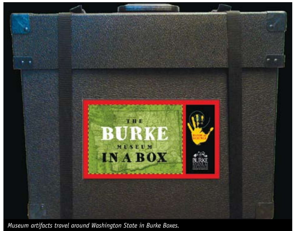
Museum artifacts travel around Washington State in Burke Boxes.

As curriculum and teaching methodologies have changed, the museum resources have been updated and restructured to serve students and teachers more effectively. The most recent major renovation to the original "Traveling Study Collections" program