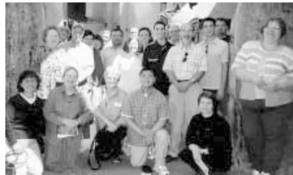
This year was the silver anniversary of the K-12 STUDY CANADA Summer Institute . Educators from across the country traveled to Vancouver, B.C. as part of the Institute.

Our summer outreach began memorably with the 25th anniversary of the Annual STUDY CANADA Summer Institute for K-12 Educators . Teachers from five states - Washington, Colorado, Arizona, Texas and South Carolina - attended the program and celebrated