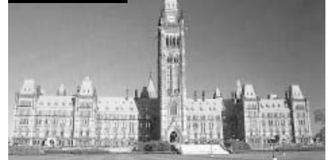
The Parliament buildings in Ottawa, Ontario.

Here is a fun fact — the Queen of England is not able to visit Canada because, the moment she sets foot on Canadian soil, she becomes the Queen of Canada!