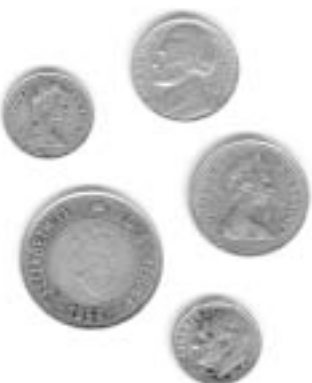
Using coinage from both countries immediately illustrates much about the difference in governance between Canada and the US. Both countries feature their heads of state on much of their coinage — the Queen in Canada; past presidents in the US.

Canada, like the US, is a democracy. In both countries there are provincial or state governments that take care of local concerns and federal governments that take care of national business. At the national or federal level, the governments in the two countries differ substantially. Canada's parliamentary system is based on the British parliamentary system which includes three fundamental elements — the Monarch, the upper house which reviews legislation (the Senate), and the House of Commons. To this system Canada added elements of the U.S. federal