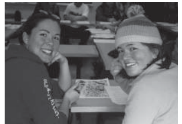
This year over 800 high school students from across the state took part in World Languages Day at UW. These two students selected a presentation on Inuktitut, the Inuit language, and commented that "World Languages Day made me want to go to the UW and major in a foreign language.... I liked the way the professors taught the classes - they really knew their subjects and enjoyed teaching about them."