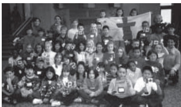
Every year K-12 STUDY CANADA programming introduces hundreds of school children to Canada. This enthusiastic group is from Lowell Elementary School in Seattle.

K-12 STUDY CANADA is a semi-annual publication of the Pacific Northwest National Resource Center for Canada (NRC) - a joint center linking the Canadian Studies Center, Henry M. Jackson School of International Studies, University of Washington to the Center for Canadian-American Studies, Western Washington University. The NRC offers quarterly workshops on specific Canadian topics; the annual, week-long STUDY CANADA seminar held the last week of June; teacher loan-kits; and an extensive Resource Library for the use of local educators. The NRC is funded through a Title VI Grant from the U.S. Department of Education and an annual Program Enhancement Grant from the Canadian Embassy, Washington, D.C.