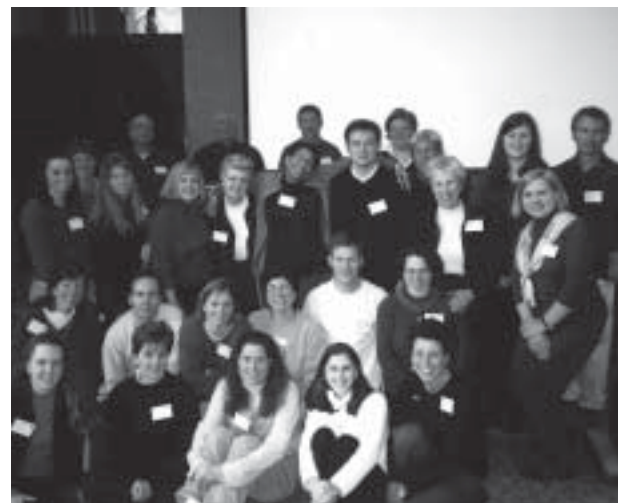
Over 30 educators from the region took part in the "Quebec in Seattle" all-day workshop. One teacher wrote, "It is great to listen to people loving what they do and enjoying sharing their knowledge and opinions with others - I'll use the information and share it!"